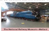
The National Railway Museum—Mallard